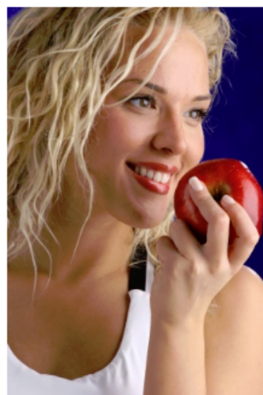
Beautiful Healthy Smiles Can Equal Improved Self-Esteem & Success in Life

that the quality of your life has changed. It doesn't have to be that way. Dental implants are the solution to reinventing your smile, your ability to chew and even the quality of your life.