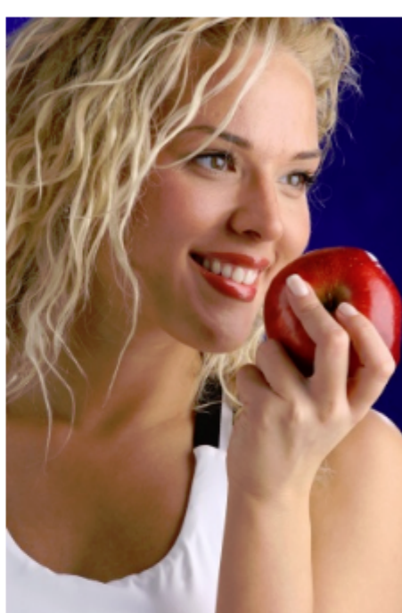
Beautiful Healthy Smiles Can Equal Improved Self-Esteem & Success in Life

What Does Your Smile Say About You? Perhaps you've lost a tooth, or even several. Chewing has become difficult for you and you've even avoided smiling. You are self-conscious about your appearance most of the time. There is no question that the quality of your life has changed. It doesn't have to be that way. Dental implants are the solution to reinventing your smile, your ability to chew and even the quality of your life.